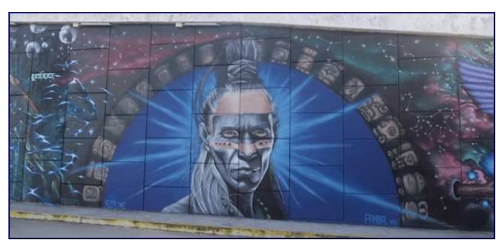
Street mural in Akumal

during the late nineteenth and early twentieth century. Today it has a Yucatec mayor who belongs to Mexico's new ruling MORENA (socialist party). He is using the revenue from tourism to enhance the beauty and safety of the centre of the town. As a result of tourism, the permanent population in the state of Quintana Roo has grown from 50,000 to 1,500,000. There are Yucatec from Quintana Roo and Yucatan, Tzotzil and Tzeltal Maya from Chiapas, Nahua and other migrants from Mexico City, and American and Canadian expatriates. There are also "snowbirds" like ourselves and vacationers. Tourism is a mixed blessing. In the new buildings that local Yucatec call the PLASTICO FANTASTICO, "culture" is for sale. You can buy a miniature pyramid and a sombrero that no sane Mexican would wear. Tourism has put tortillas on the table for many people, and most Maya would be worse off economically without it. However, social inequality, environmental destruction and corruption and organized warfare between drug gangs represent a major challenge to the municipal, state and federal authorities.